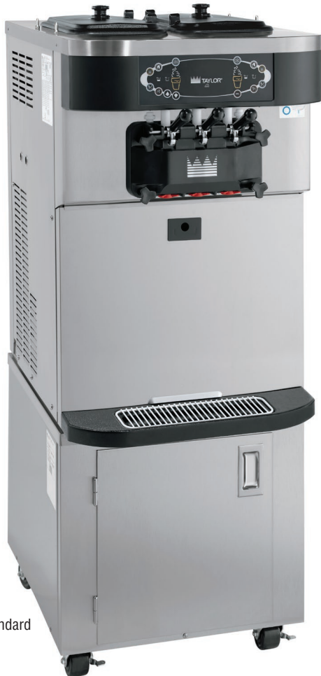
Shown with optional standard height cart.