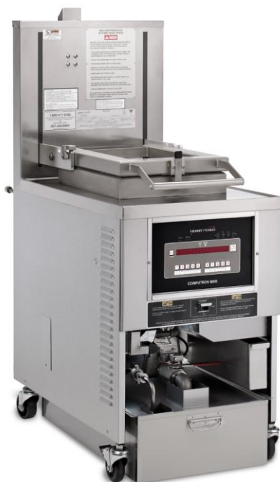
OFG 391 high volume gas open fryer

Henny Penny high volume open fryers offer tremendous throughput in a highly reliable frying platform with programmable operation, oil functions and fast, easy filtration.