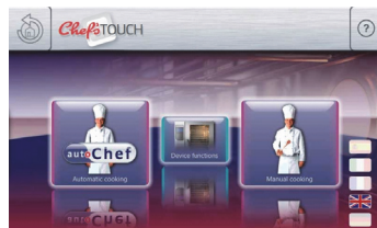
Chef's Touch control: Just tap and swipe to run automated cooking and operating apps

Henny Penny FlexFusion combi ovens combine different cooking methods into one piece of equipment with the flexibility to cook nearly everything on your menu to perfection.