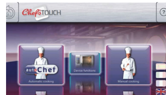
Chef's Touch control: Just tap and swipe to run automated cooking and operating apps

What really sets FlexFusion apart is its ease of use. The Platinum line features Chef'sTouch, an intuitive control system with a durable 7-inch touch/swipe screen that makes